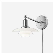
PH 2/1 Wall