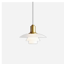
PH 2/1 Pendant